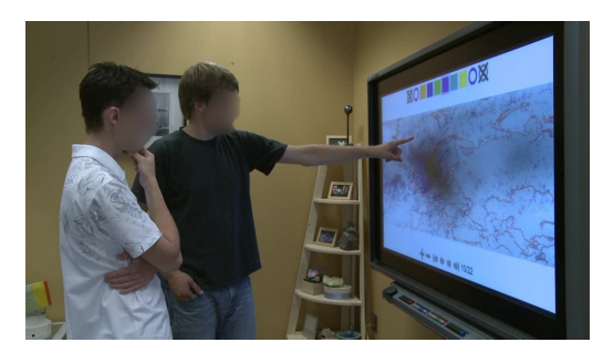
Fig. 2. Participants in front of the touch-sensitive wall display, collaboratively working with our data exploration and visualization tool.

The goal of our study was to better understand how pairs of people work with customizable vector visualization on a large touchinteractive display. Specifically, we investigated the potential of handposture-driven interaction with vector data to ease the process of exploring and visualizing such datasets and how people approach 2D vector data analysis tasks using our visualization tool on a large wall display. Quantitative study methods that rely on controlled study scenarios and the collection and analysis of numerical data are less adequate for answering open-ended questions like these. We therefore conducted an exploratory laboratory study where pairs of participants were asked to complete a series of experimental tasks. The study was based on a mixed methods approach which allowed us to combine